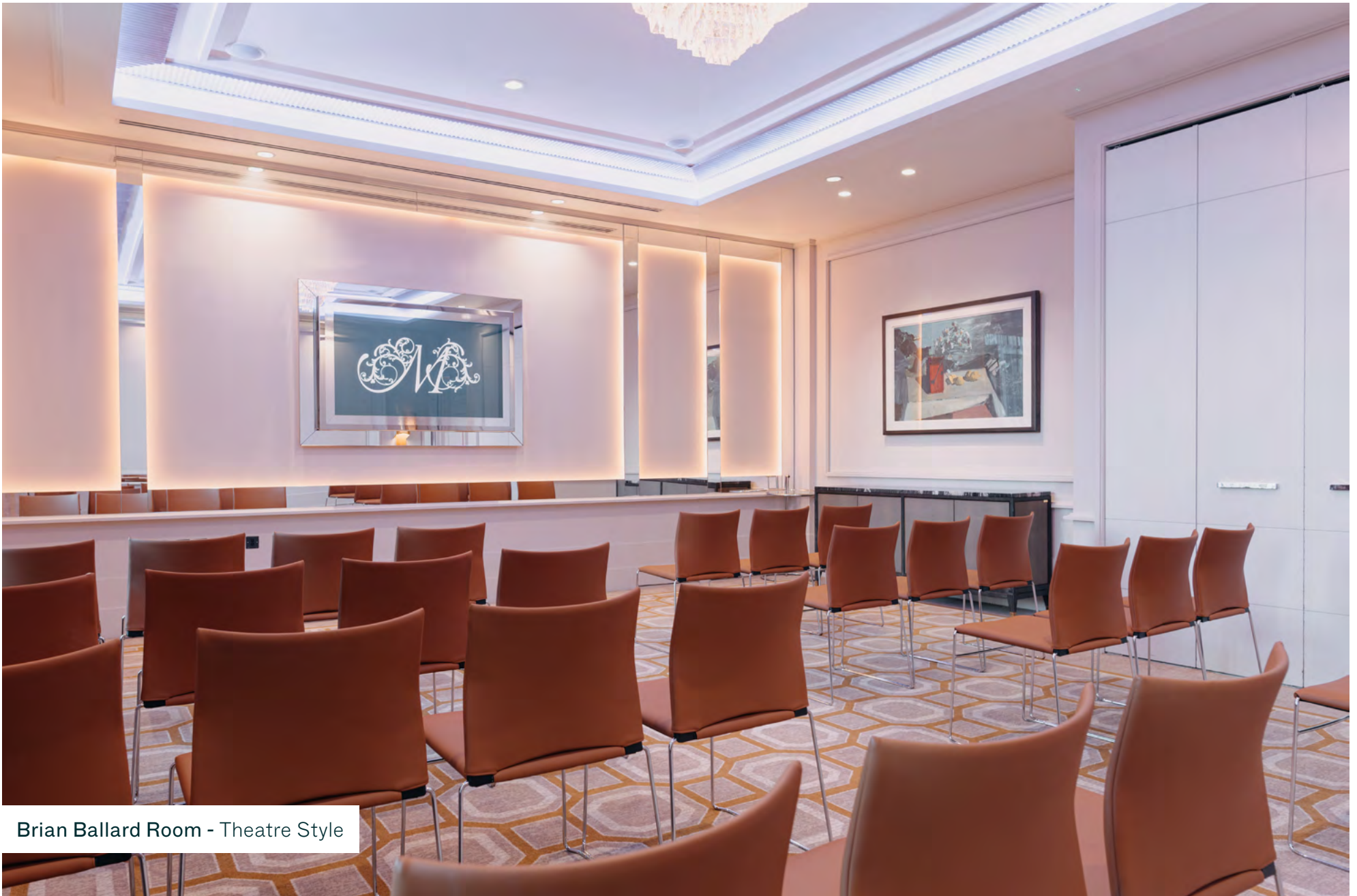
Brian Ballard Room - Theatre Style