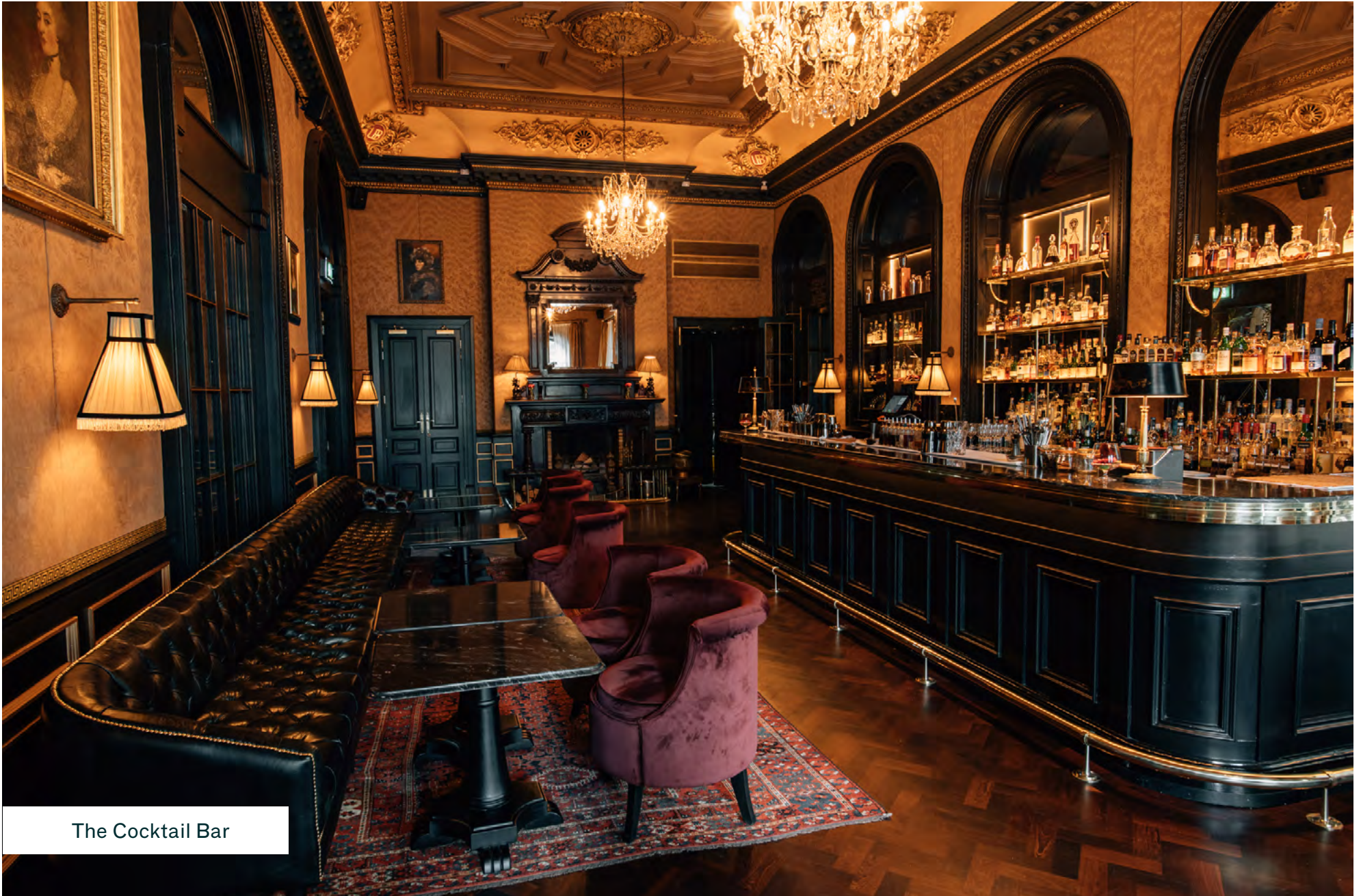
The Cocktail Bar