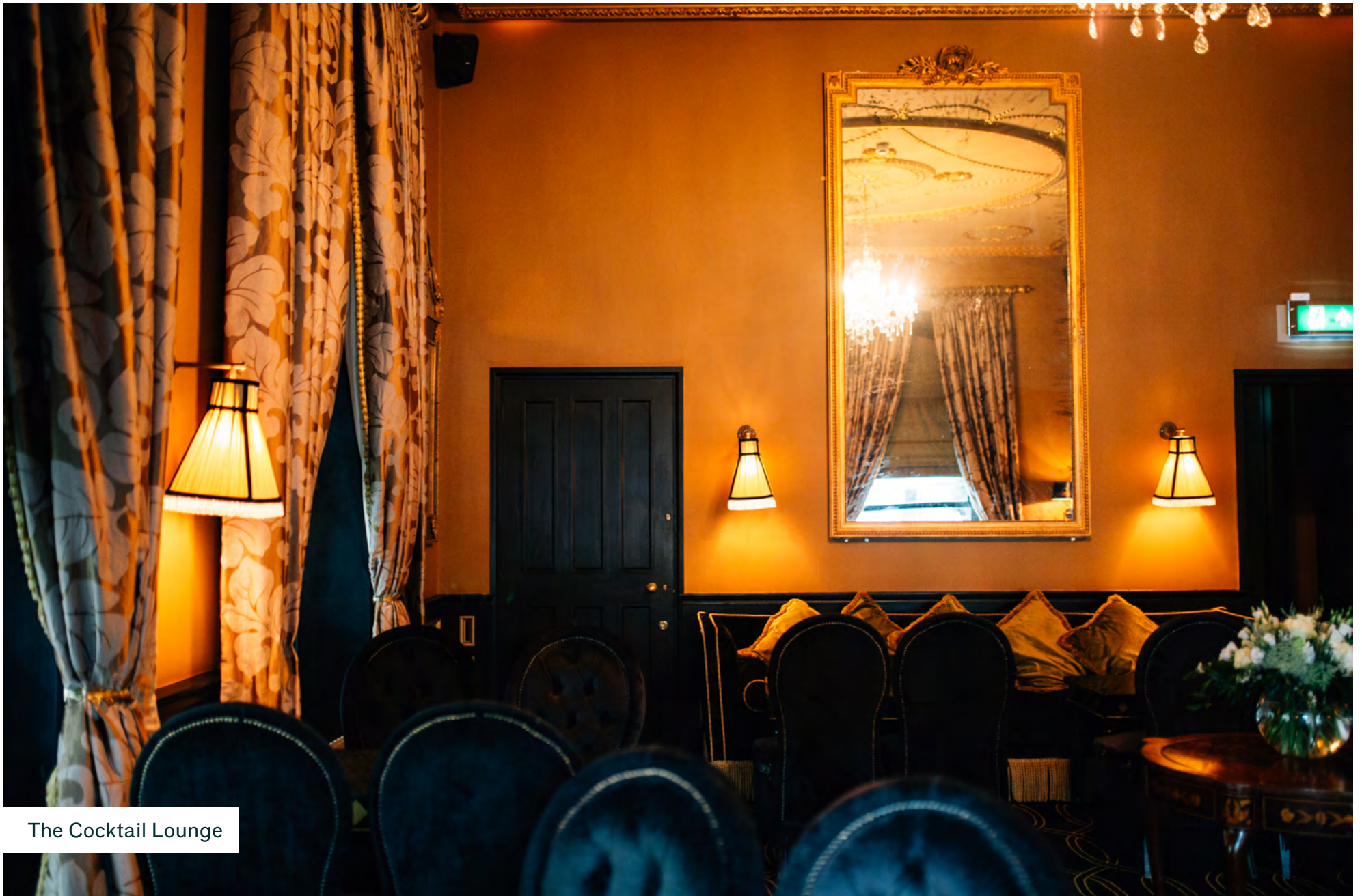
The Cocktail Lounge