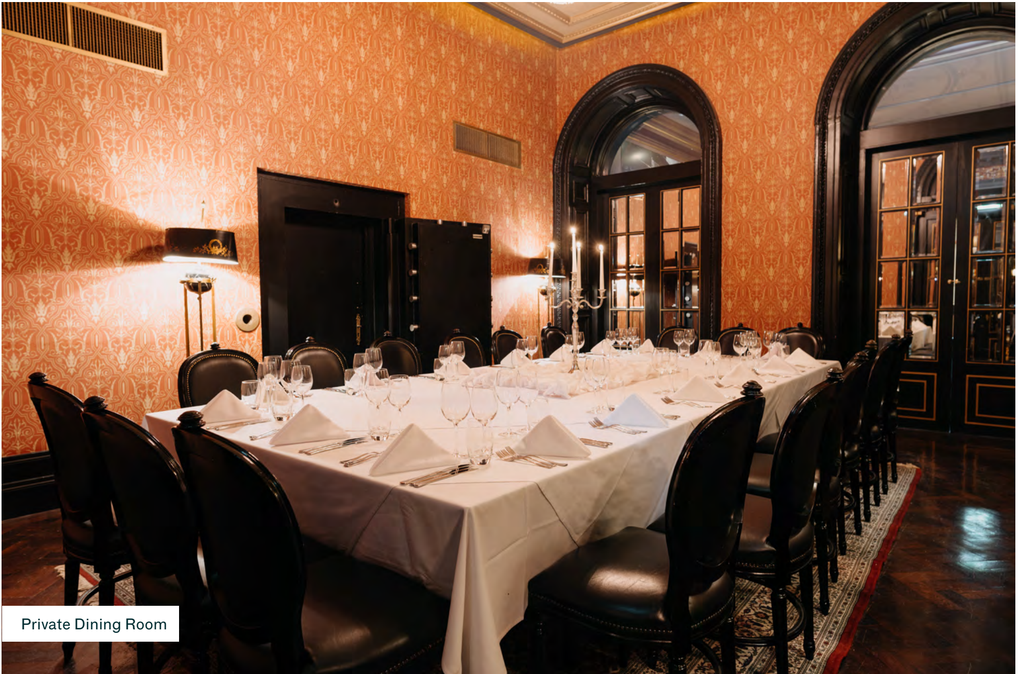
Private Dining Room