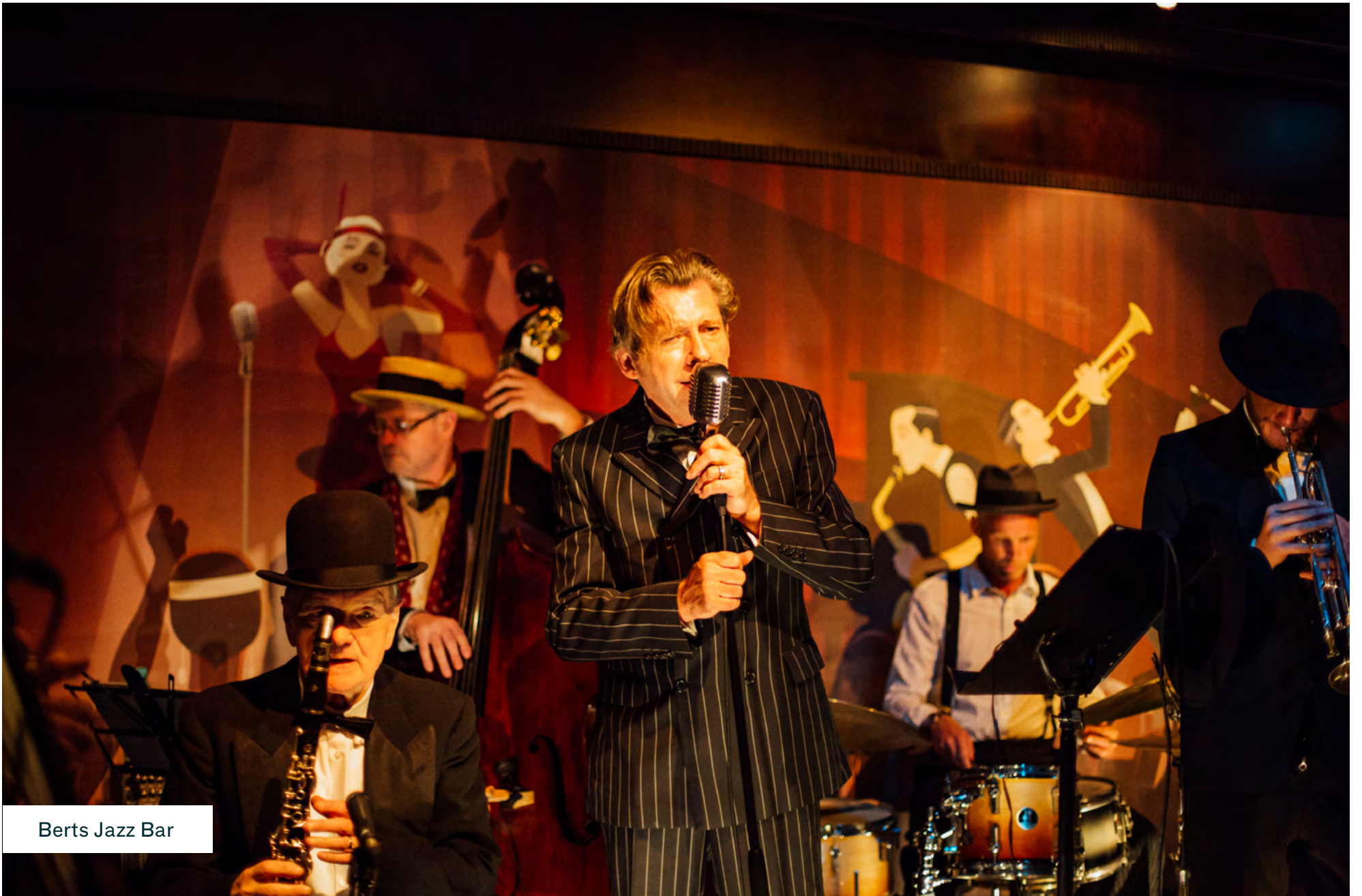
Berts Jazz Bar