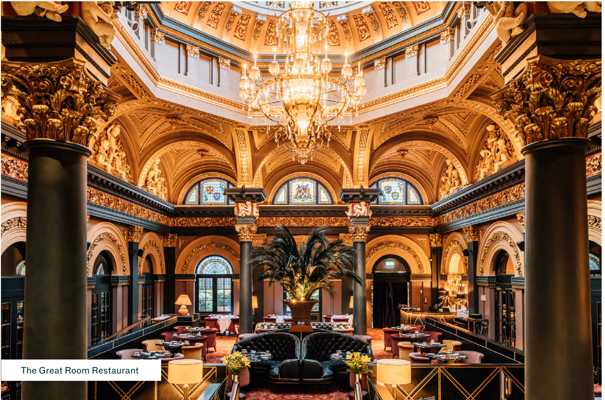
The Great Room Restaurant