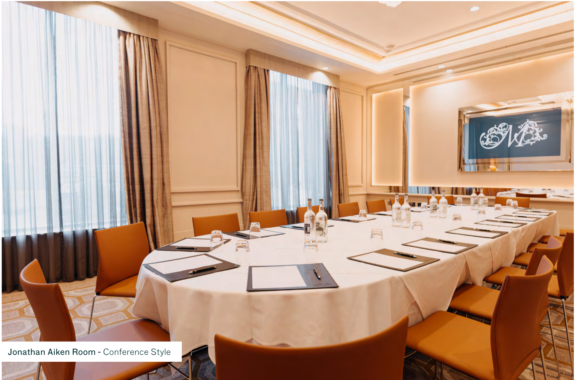
Jonathan Aiken Room - Conference Style