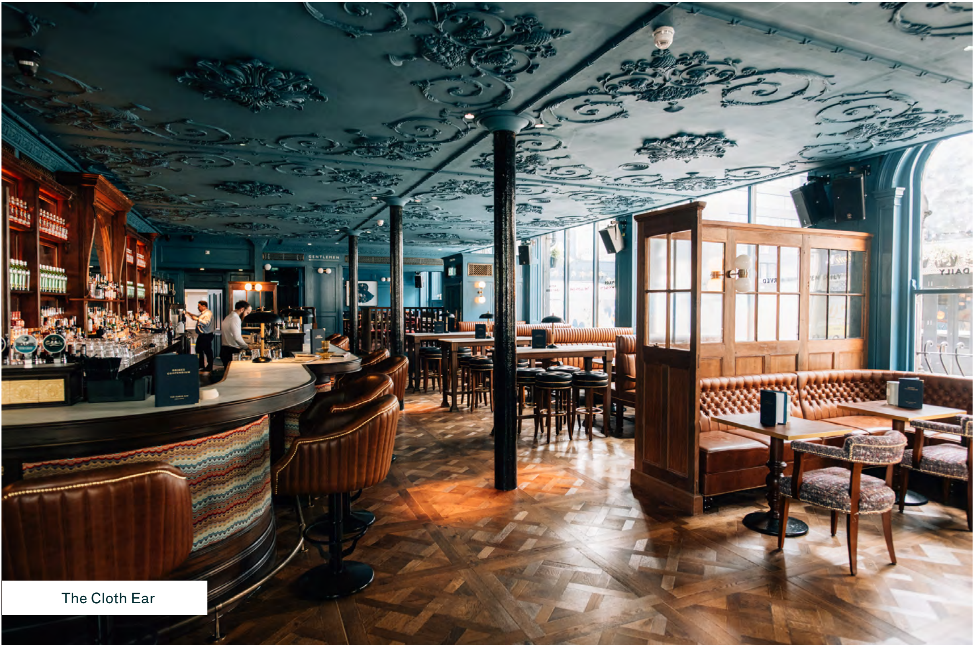
The Cloth Ear