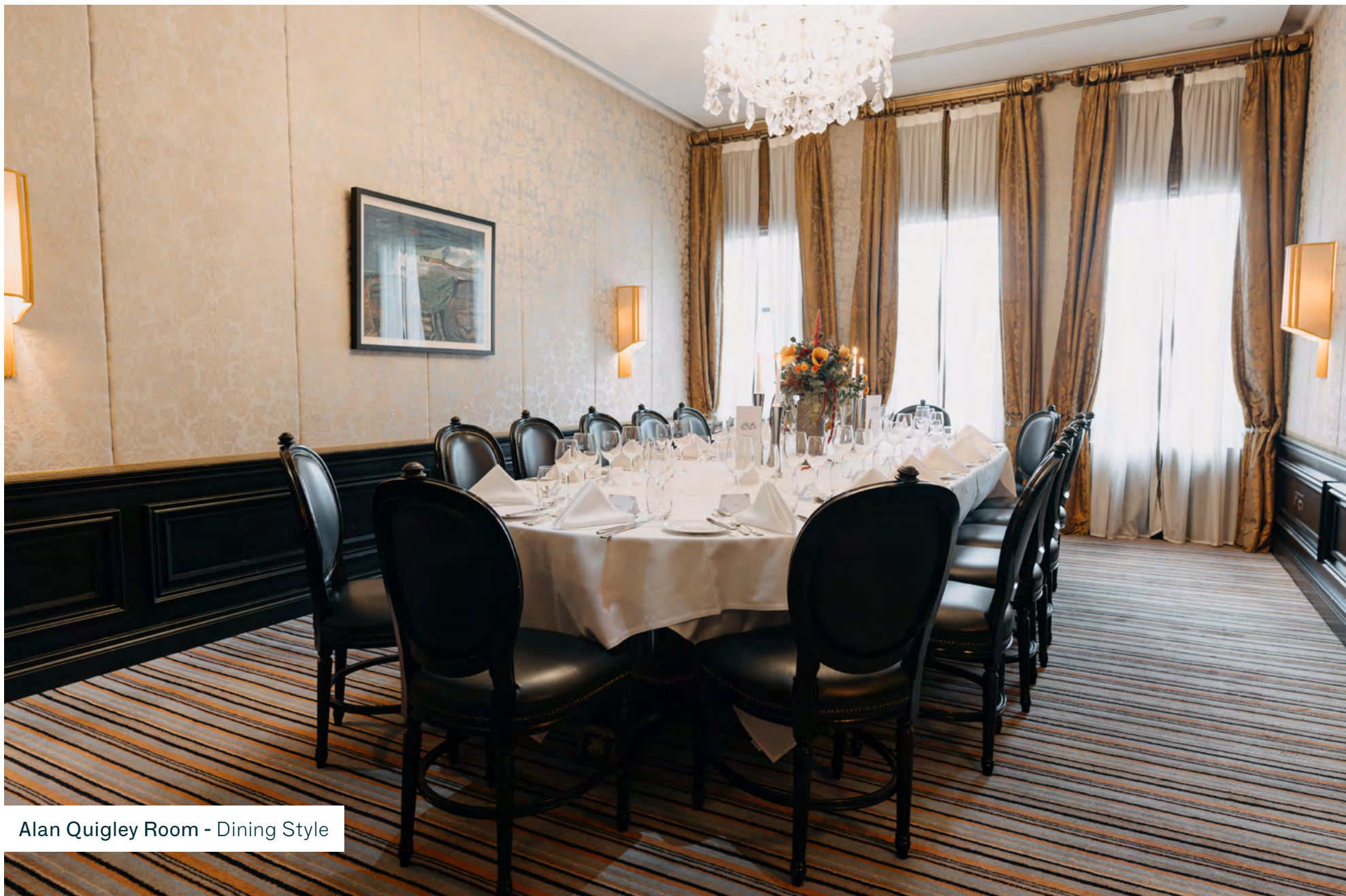
Alan Quigley Room - Dining Style