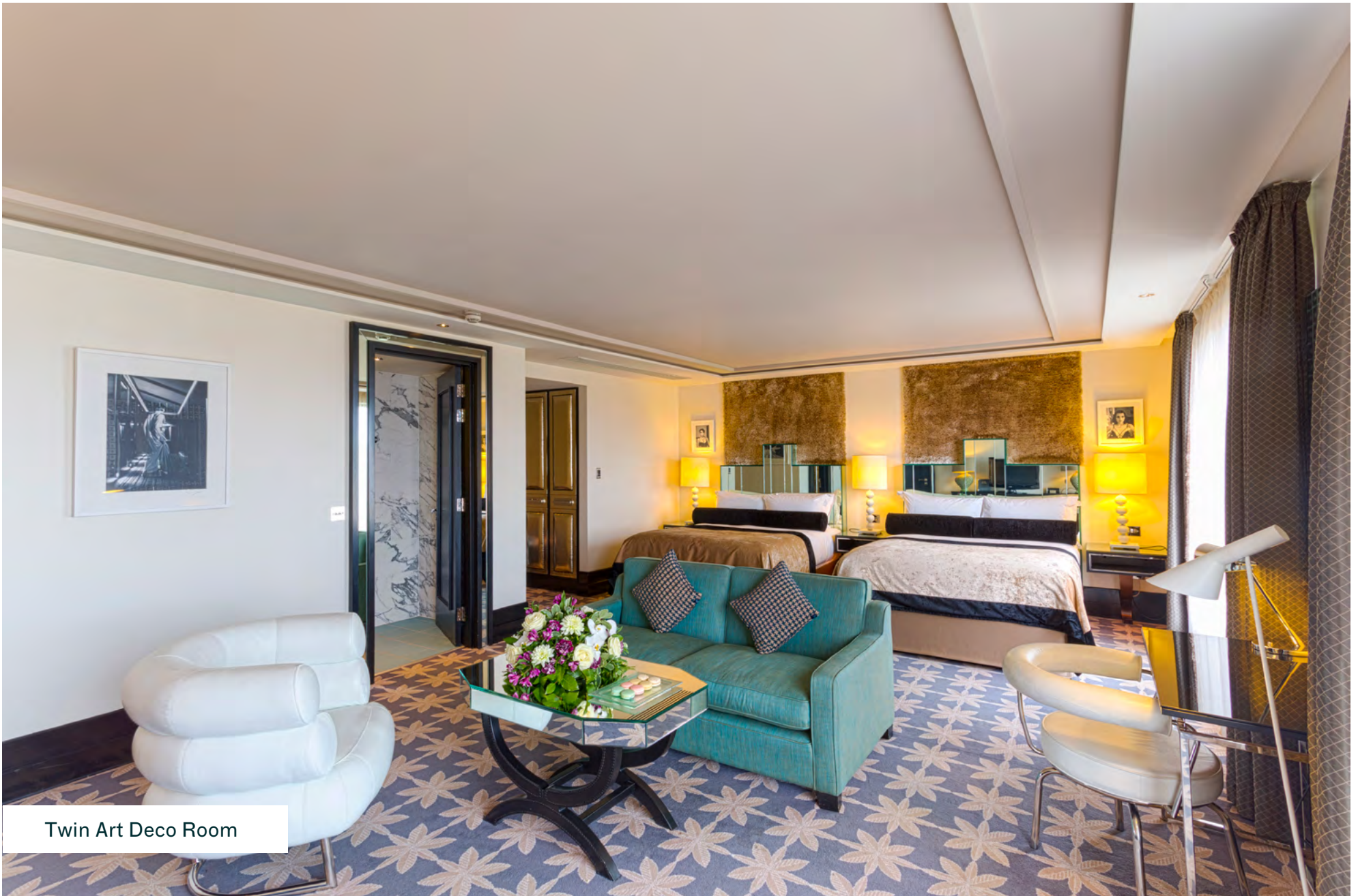
Twin Art Deco Room